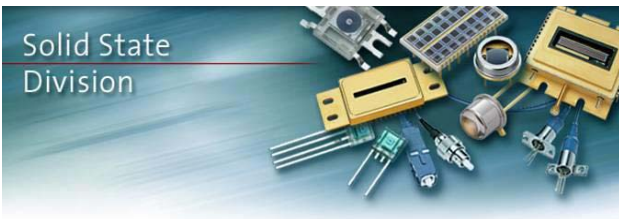
Solid State Division

Photodiodes, Photo ICs, Image Sensors, Infrared Sensors, X-ray Sensors, Solid State Emitters, etc.