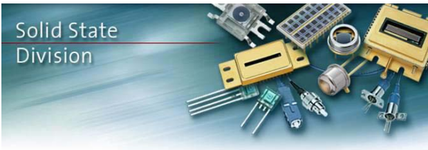
Solid State Division

Photodiodes, Photo ICs, Image Sensors, Infrared Sensors, X-ray Sensors, Solid State Emitters, etc.