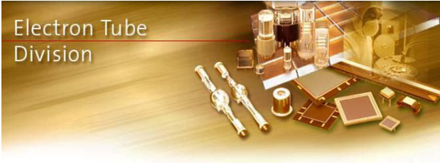
Electron Tube Division

Photomultiplier Tubes, Light Sources, Fiber Optics Plates, Image Sensors, X-ray Products, etc.